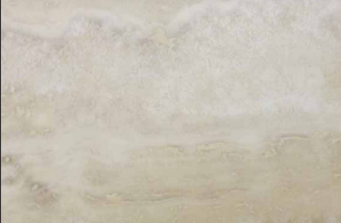
Aegean Travertine Ivory - 742915