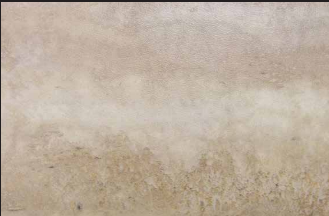
Aegean Travertine Noche - 742917