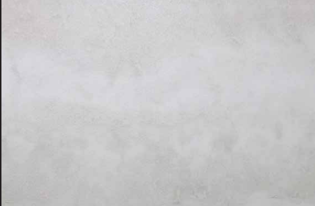
Aegean Travertine White - 742913

Embossing: Satin / Thickness: 5.00mm / Wear Layer: 0.55mm / Coating: Ceramic Bead / Utilization Class: 33/42 / Produced with 100% pure vinyl. Does not contain recycled material and therefore all contents conform to EU standards. EasyLock itself can be completely recycled.