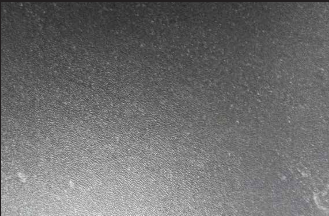
Sandstone Midnight - 48818