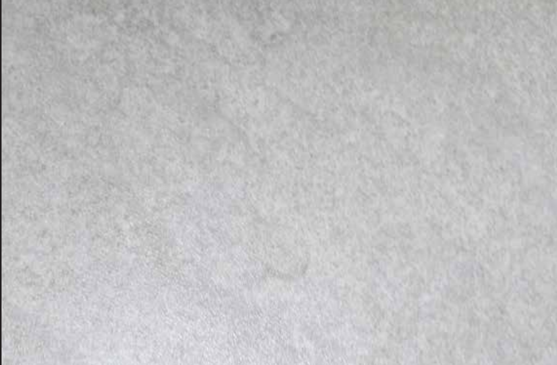
Sandstone Oyster - 48813

Embossing: Satin / Thickness: 5.00mm / Wear Layer: 0.55mm / Coating: Ceramic Bead / Utilization Class: 33/42 / Produced with 100% pure vinyl. Does not contain recycled material and therefore all contents conform to EU standards. EasyLock itself can be completely recycled.