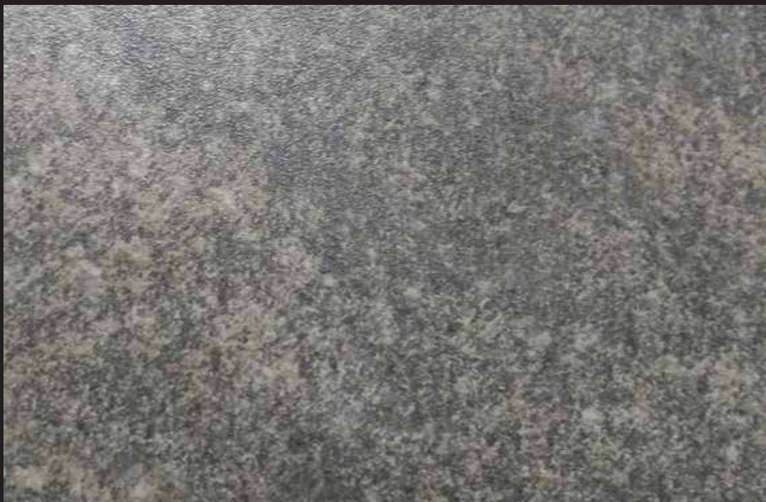
Sandstone Steel - 48817