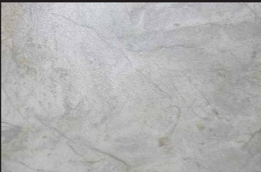
New Marble Grey - 46413