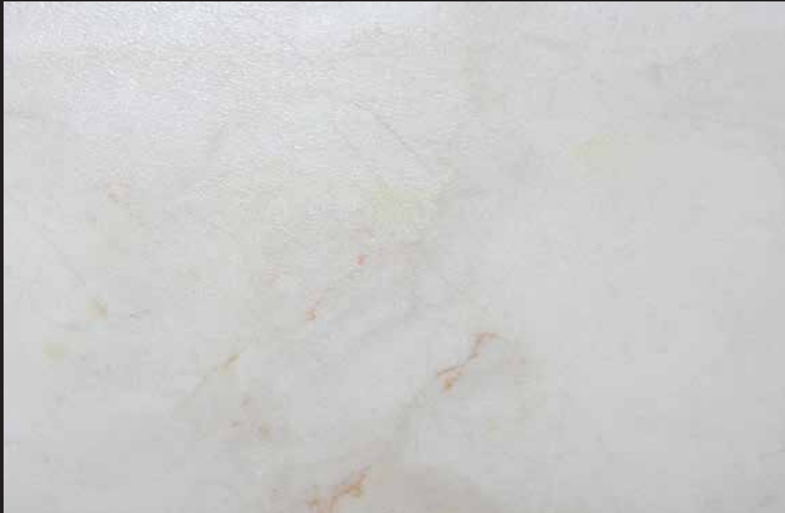
New Marble Crema - 46415