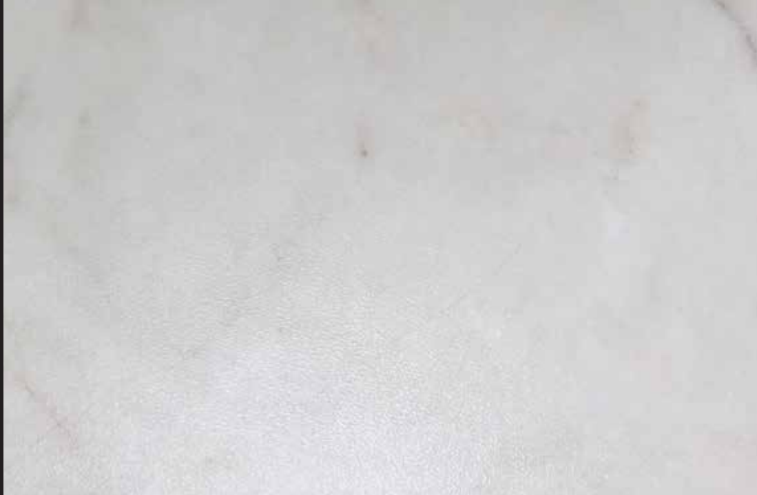
Carrara White - 46513

Embossing: Satin / Thickness: 5.00mm / Wear Layer: 0.55mm / Coating: Ceramic Bead / Utilization Class: 33/42 / Produced with 100% pure vinyl. Does not contain recycled material and therefore all contents conform to EU standards. EasyLock itself can be completely recycled.