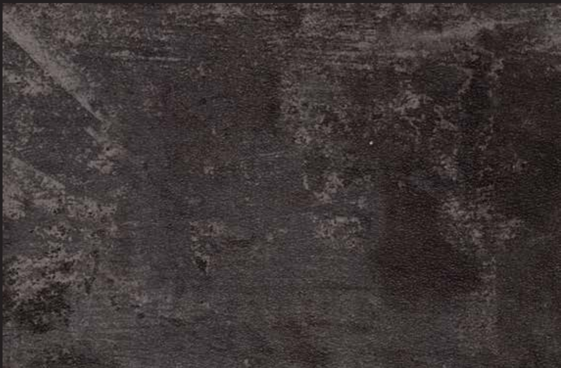
Espana Toledo - 35711