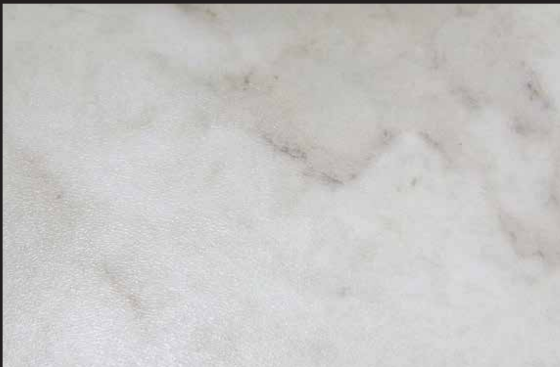
Carrara Oyster - 46514