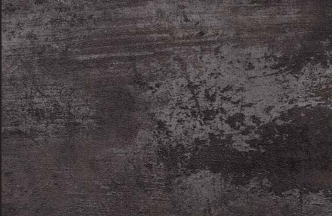
Espana Cadiz - 35713